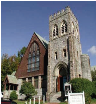
147 High Street